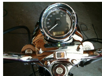
Figure 2: Top Clamp Mount